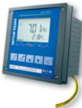
pH 2100 e transmitter.

With HART®, PROFIBUS® and FOUNDATION Fieldbus, METTLER TOLEDO now has at its command state-of-the-art digital fieldbus protocols able to be linked to the respective process control system without any difficulty. ■