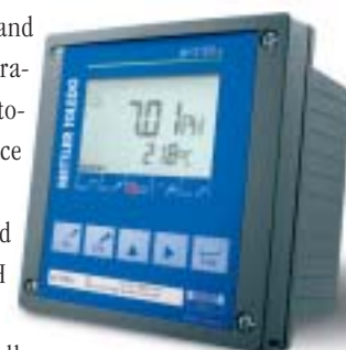
pH 2100e transmitter.