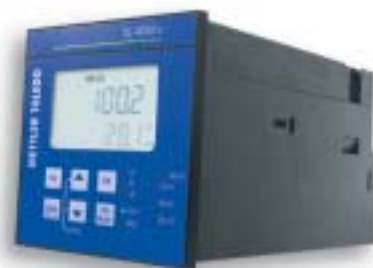
Cond 7050 e.